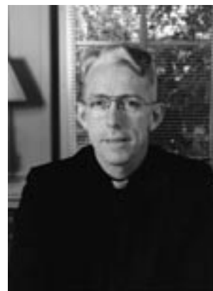
Rev. Edward A. Malloy, C.S.C.